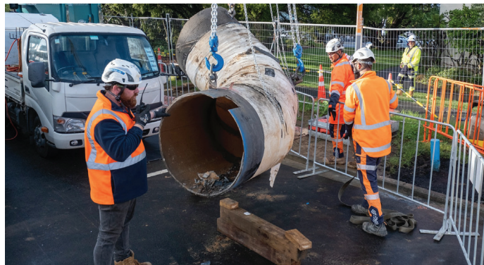
Above: Old Huia watermain pipe being lifted out of Heaphy St

Watercare said, "We recognise this project was disruptive to communities and commuters along the route, and we'd really like to thank everyone for their patience while we built this critical watermain. It goes a long way to improving the resilience of our water network in these areas and will supply drinking water to western and central communities for generations to come."