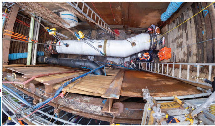
Below: The final piece being lowered into place in Heaphy St